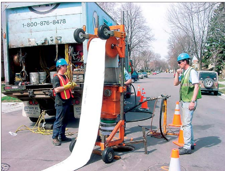
A crew prepares a CIPP lining from National Liner for a trenchless repair job on a main in Graettinger.

The next step is to re-instate the laterals to restore sewer service to prop-