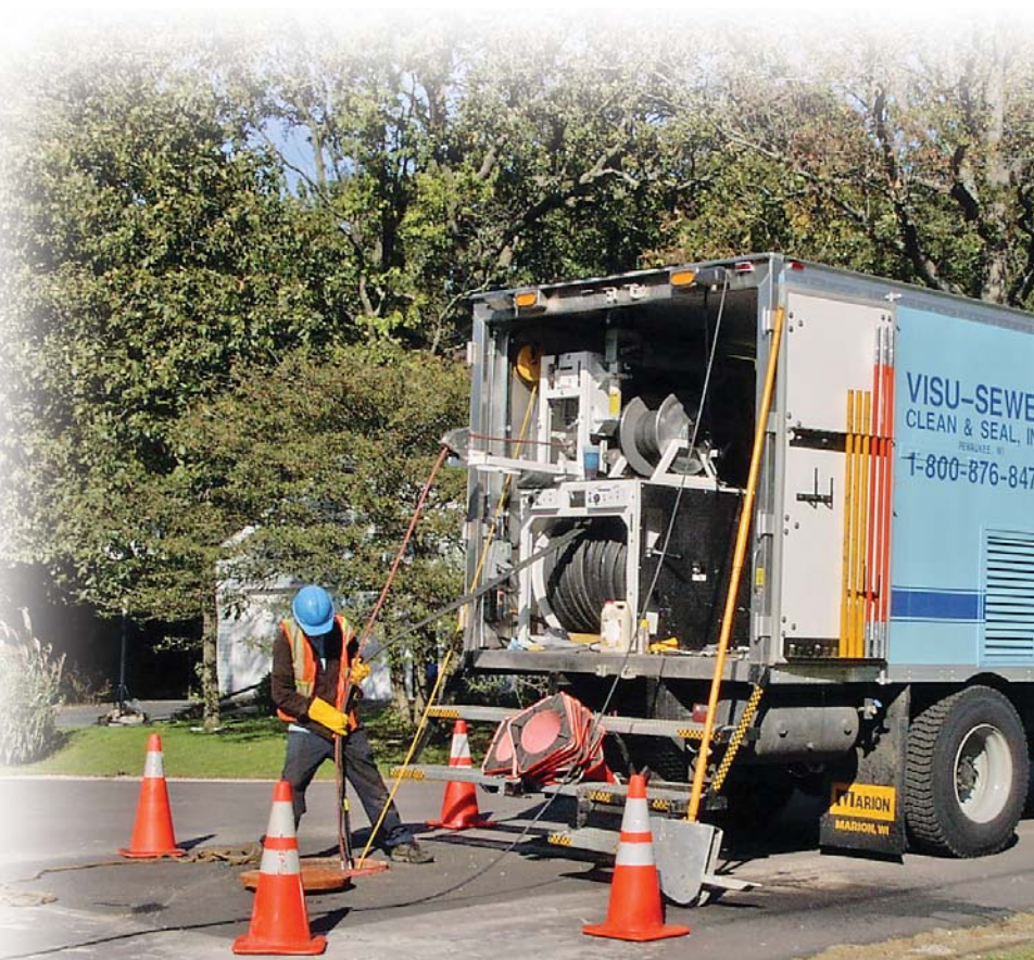
A technician from Visu-Sewer Clean & Seal Inc. starts an inspection of a sewer main in the City of Graettinger, Iowa, as part of the city's program to control inflow and infiltration.